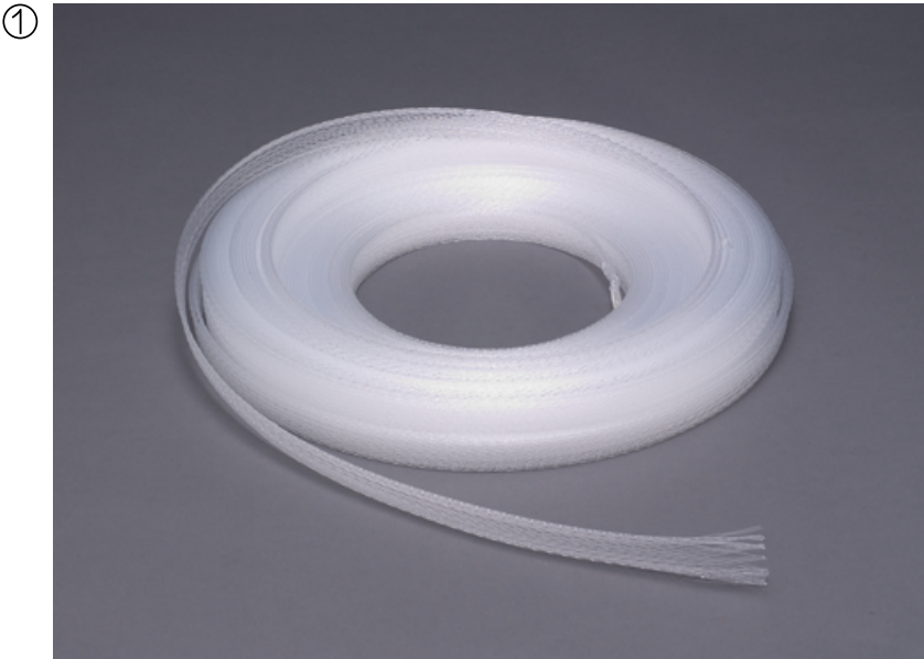
MacBeam (U.S. Patent No. 6,705,193B2)